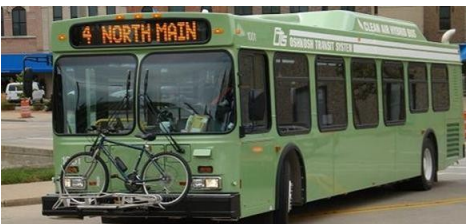
Shuttle bus operates from 6 a.m. to 9 p.m.

dorms. They pitch a tent in the parking lot for the overflow. Why not? There are no cars, everyone walked over from their dorms. You will meet people who are fun to talk with. I had