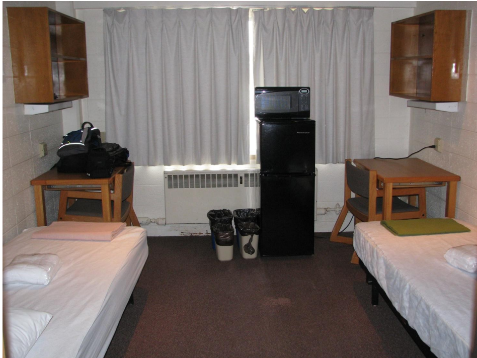
A typical dorm room at the University of Wisconsin at Oshkosh.

After settling in I decided to check out the neighborhood. I entered the hallway just as another fellow was leaving his room and I said to him, "next time I come, I'll bring a fan, for sure!" He looked at me a bit funnier than I would have expected, and I wondered if I had said something wrong—and I also thought that he