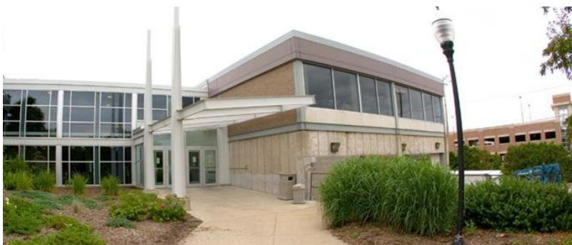
Blackhawk Commons – a University of Wisconsin student food services building.