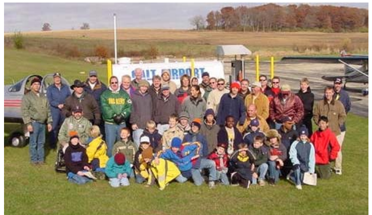
We flew 28 Young Eagles on the same day another Illinois Chapter had the honor of flying the 1,000,000 th