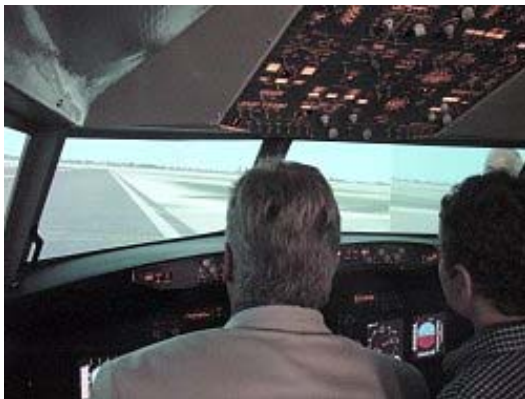
The panoramic visual in the B-737 sim. will blow you away!

DON'T MISS THIS ONE! An exclusive tour of the Challenger Learning Center in Woodstock for EAA 932 members on Saturday, February 22, at 10 AM.